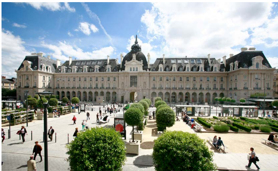
Ville de Rennes - Adeline Keil